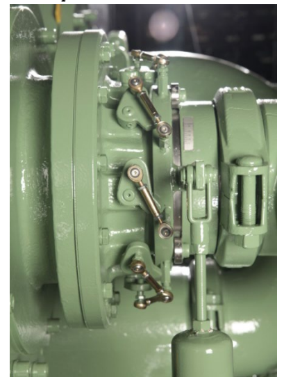
Figure 3: Side-view of mounted IGV showing the yoke assembly and actuator.