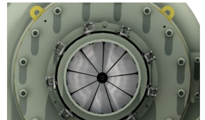
Figure 2: Front-view of IGV in fully-closed position.